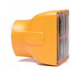
BODY TIP 16.0cm<sup>2</sup>

Uses precise, shallow heating to address wrinkles within the periorbital area and/or the eyelid itself.**