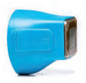
TOTAL TIP 3.0cm<sup>2</sup>

Offers vibration enhancements for effective<sup>6</sup> and comfortable<sup>4</sup> body treatments