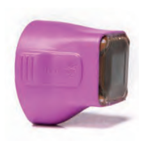
TOTAL TIP 4.0cm<sup>2</sup>

Up to 25% faster* than Total Tip 3.0. Uses precise heating to address lines and wrinkles and offers vibration to help patient comfort.<sup>4</sup>