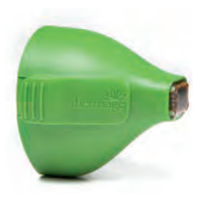
EYE TIP 0.25cm<sup>2</sup>

Up to 25% faster* than Total Tip 3.0. Uses precise heating to address lines and wrinkles and offers vibration to help patient comfort.<sup>4</sup>